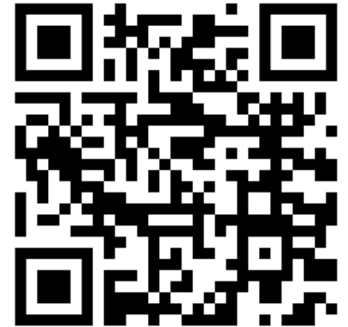
CAA Website Link