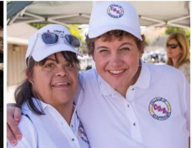
Health & Wellness