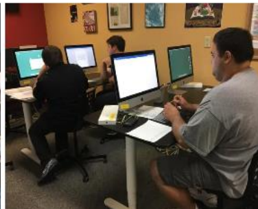
Science and Technology