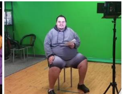
Digital Media Studies