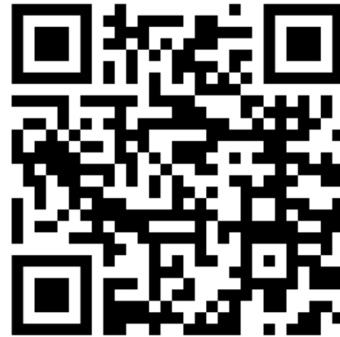
CAA Impact Video